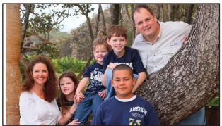
page 2 Upcoming Events