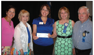
page 3 Community Cares

10420 Heart of Hope Way Keithville, LA 71047 318.925.4663 www.heartofhopeministry.com