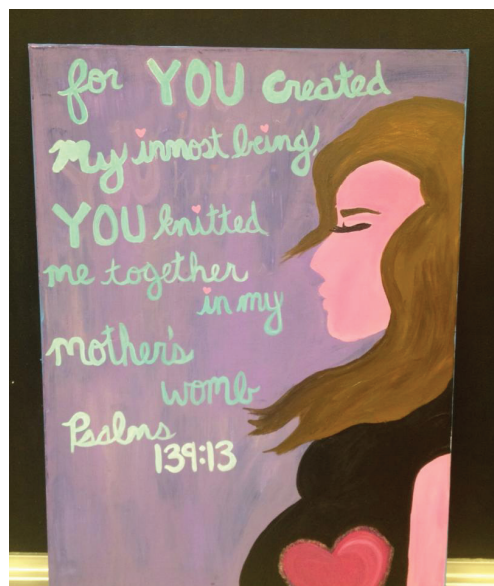
Created by CO-OP, Young Adult Ministry at Word of God, Shreveport.

For you created my inmost being; you knit me together in my mother's womb. I praise you because I am fearfully and wonderfully made; your works are wonderful, I know that full well. My frame was not hidden from you when I was made in the secret place, when I was woven together in the depths of the earth. Your eyes saw my unformed body; all the days ordained for me were written in your book before one of them came to be. Psalm 139: 13:16 (NIV)